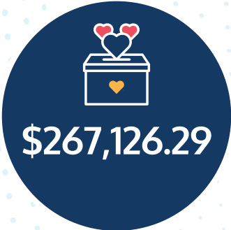
Total contributions (gifts)