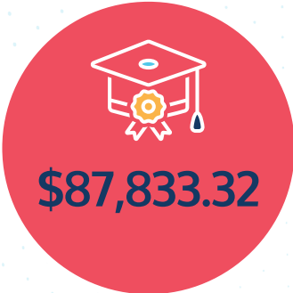
Total amount granted in scholarships

Number of students who were awarded scholarships: