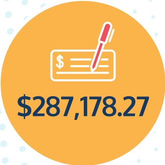
Total amount granted to the community

Number of individual organizations that received grants: